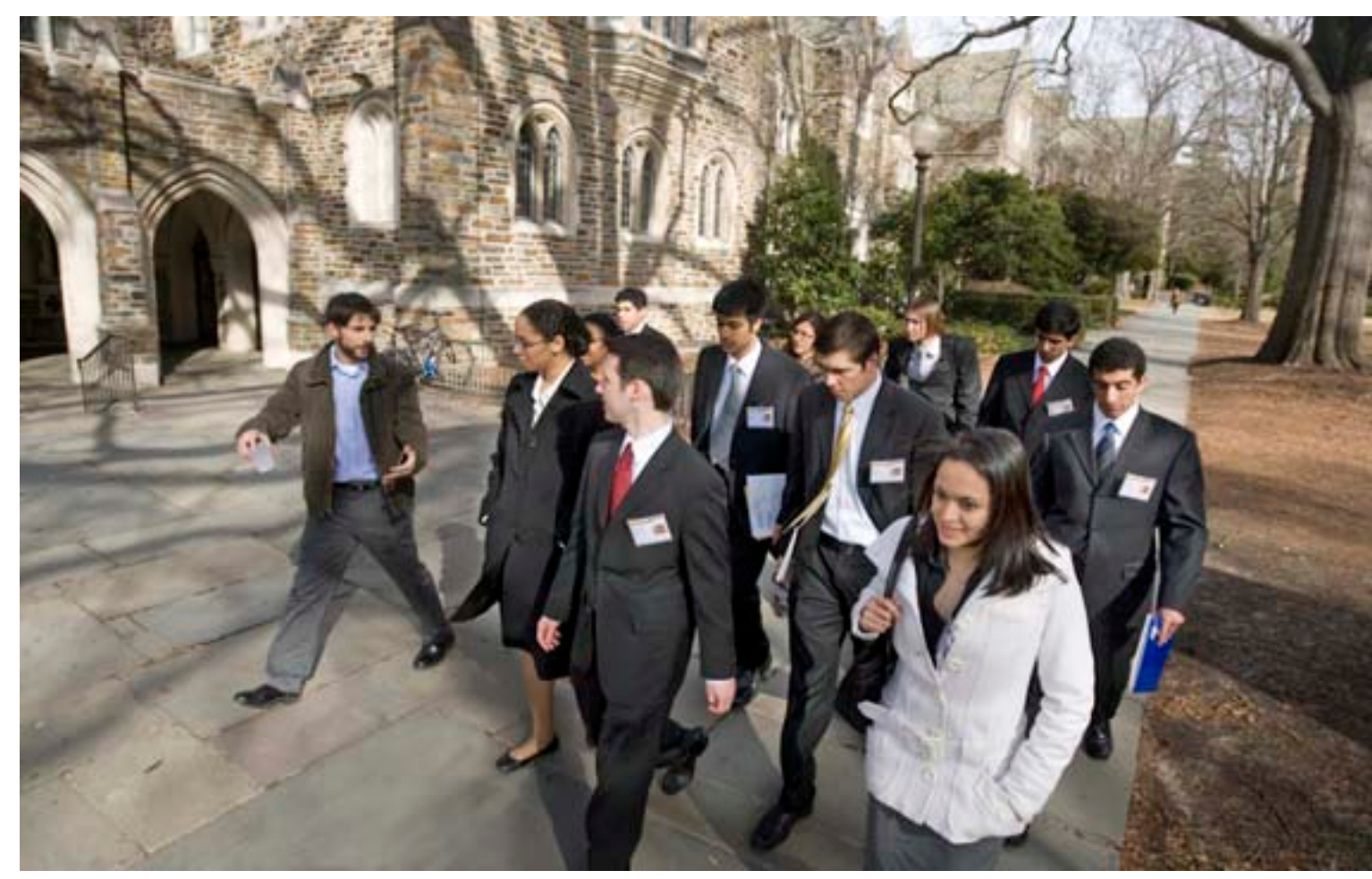
Duke medical students serve as hosts for prospective students during interviews and Second Look Weekend.

Armstrong says that on average, she makes 180 offers for every 100-slot class of medical students. That's a strong